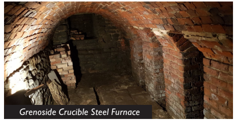
Grenoside Crucible Steel Furnace