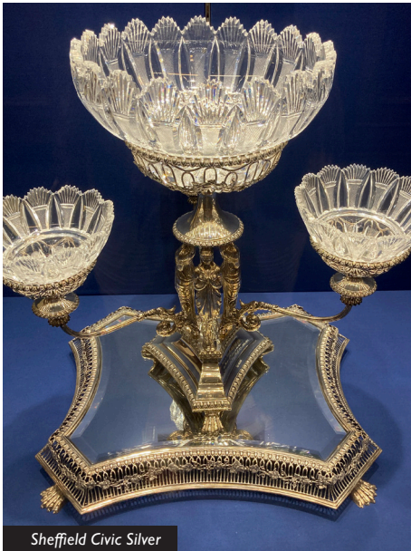
Sheffield Civic Silver