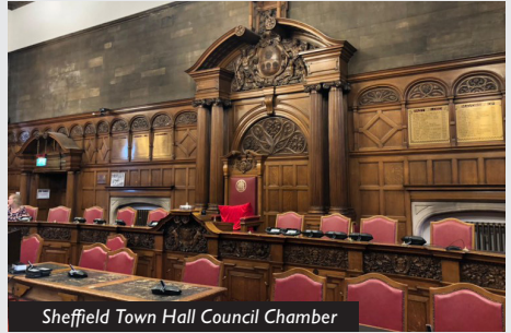
Sheffield Town Hall Council Chamber

Prebooking required at www.welcometosheffield.co.uk/walkingfestival